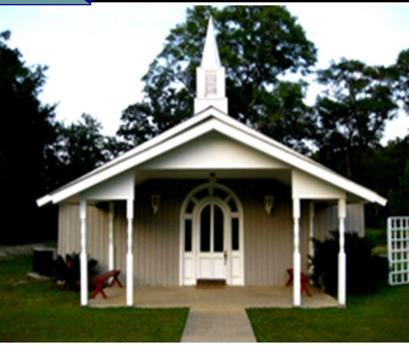
CHAPEL AT CAMP JACKSON